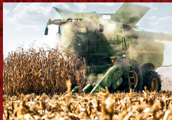
Cutting stalks precisely for pickup by row cleaners for a clear seedbed.

360 CHAINROLL™ chops and crimps stalks, making residue more available to microbial breakdown, for better soil health and nutrient availability. The advanced patented design also leaves most sections connected – like a chain – for more stable residue pieces. So you don't experience clusters of small confetti-like residue that tie up N and impede seedbed preparation.