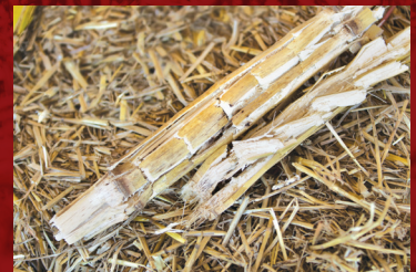
Crimping and scoring stalks to expose the interior to microbes and sizing them for faster decomposition and microbial breakdown.